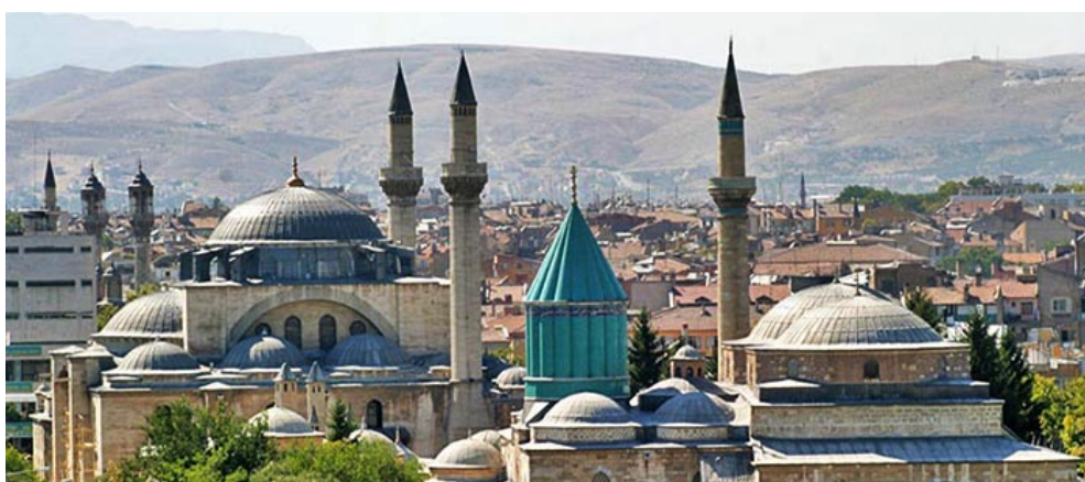
Rumi's mausoleum in Konya, Central Turkey, which is visited by more than two million visitors of many different faiths every year. The building houses the shrines of Rumi and his sons, plus the Mevlana Museum.