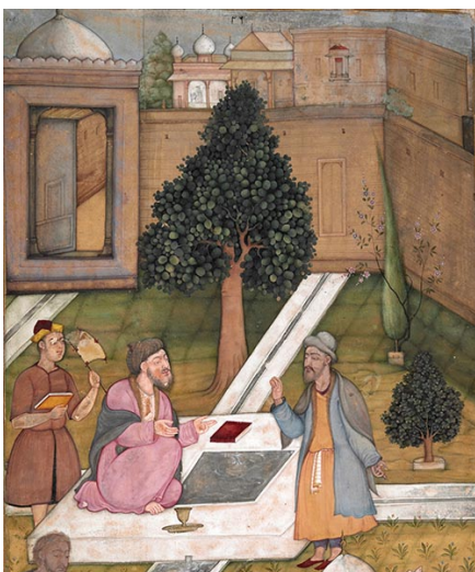
Rumi and 'Attar, the two great masters of the masnavi form, are depicted as meeting in Nishapur in an illustration to Jami's Nafahat al-Uns , Agra, India 1603.

He doesn't go as far as some mystics – such as Meister Eckhart or Ibn al-'Arabi – to talk about the absolute Godhead and elevate the concept of the Perfect Human to a virtual doctrine, although this is debatable. What I would say on this subject is that for Rumi there is a universal presence in form, and that without form there would literally be nothing and no purpose in creation. There is also the idea that all is meaning, or spirit, but without form there would be no manifestation.