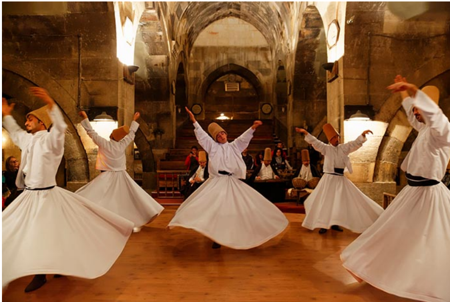
Dervishes of the Mevlevi order, founded by Rumi's son Sultan Valed, at the sema ceremony, Saruhan Caravanserai, Saruhan, near Avanos, Cappadocia.