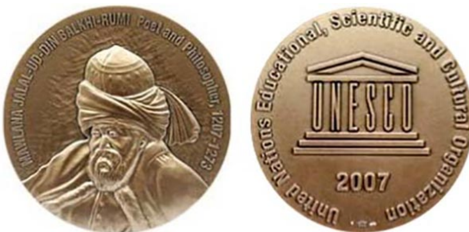
Commemorative Coin produced by UNESCO to mark the 800th anniversary of Rumi's birth.

One of things I have discovered is that Rumi the poet is himself moving throughout the Masnavi . Books 2 and 3 are much darker than the first: there is more madness and bewilderment, and the development of soliloquy. He no longer has to pull the reader out of the story into the text of a discourse, he just continues by making the story go into a dramatic dialogue, where a soliloquy doubles as his own voice, the voice of Mowlana. It makes it a dickens of a job to translate, and even more perplexing to punctuate.