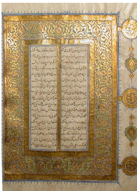
The Masnavi, Konya G Manuscript, the oldest copy of the text, kept at the Mevlana Museum in Konya.

So what I'm trying to do in my translation is to liberate the poetry from a prosaic prison, something similar in a way to what Coleman Barks has said he was trying to do in his well-known renderings, working with the old translations in front of him.[6] I've gone back to the Persian verse, and am trying to be as faithful as I can to the text. It's sometimes very difficult to find the right words in the right order, because Persian poetry is so much more concise – lacking definite and indefinite articles, pronouns and all the auxiliary verbs of English, for example.