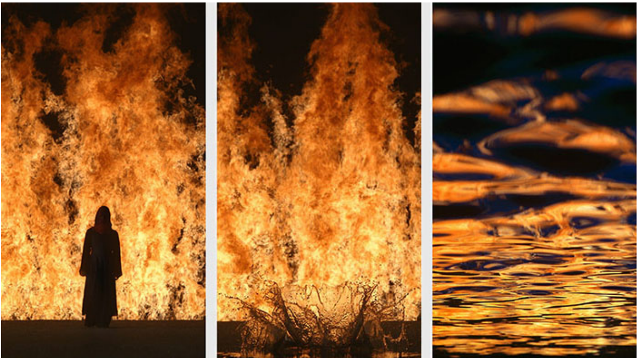
Bill Viola: Fire Woman (2005). Video/sound installation.

Such pieces benefit from being set in sacred structures where the surrounding space has been created for long and quiet contemplation. For Kira, it is as if “a special resonance is created between the works and the environment that informs not only the work, but gives new life to the building”.