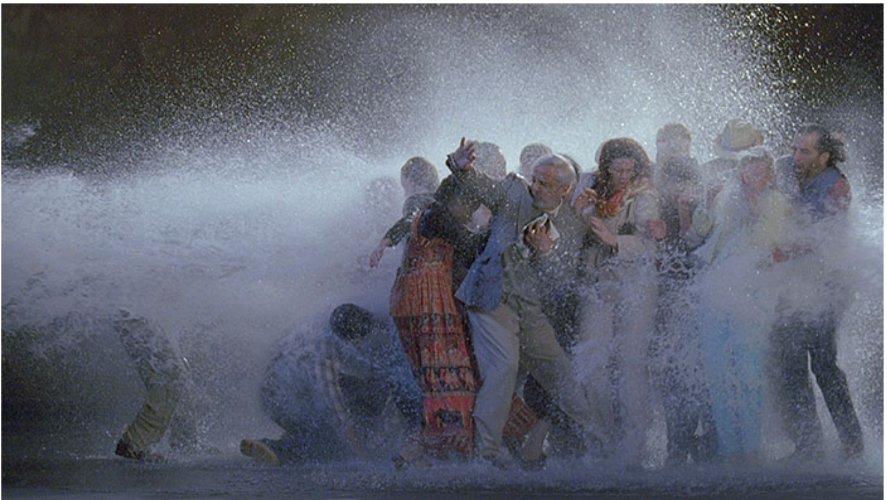
Bill Viola: The Raft (2004). Video/sound installation.

meant to be a comparison in any way. The exhibition is entitled ‘Life Death Rebirth’ and it is arranged around these themes. You sense with both artists the notion of rebirth. There is always resurrection, transformation, transfiguration. They are both asking: ‘What is this life? How am I going to pass through it? And how will I end it?’”