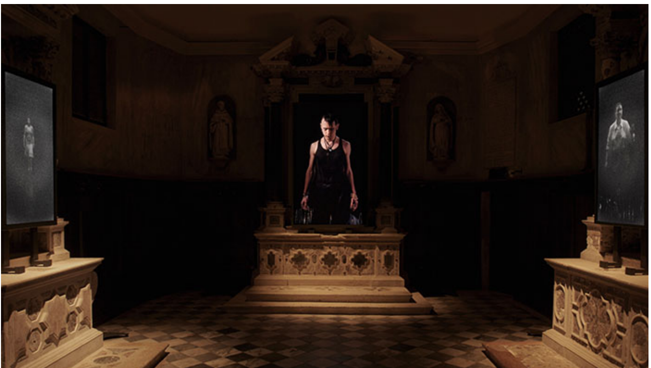
Bill Viola: Ocean Without a Shore (2007). High-definition colour video triptych. Installation view, Chiesa di San Gallo, Venice, Italy.