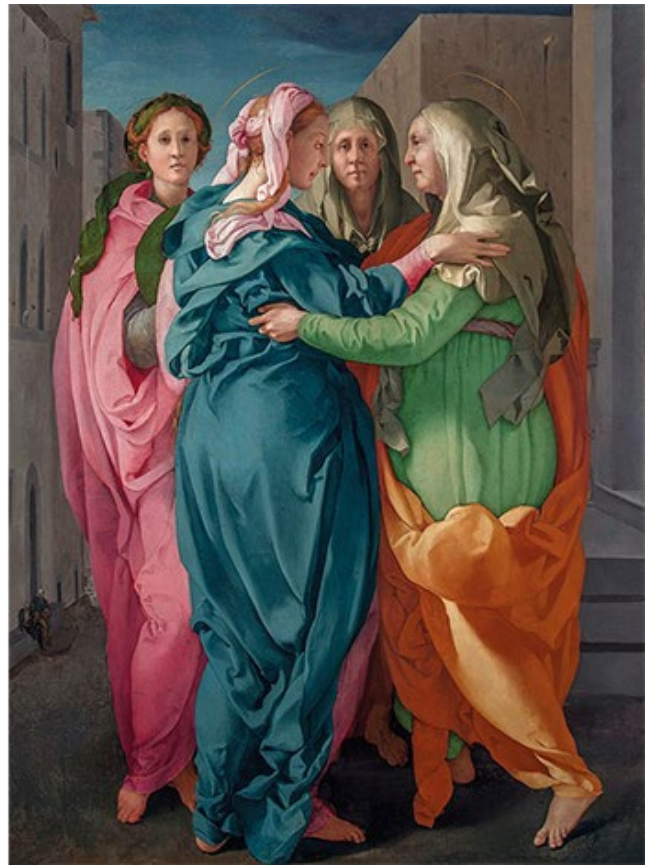
Left: The Greeting (1995) by Bill Viola. Video/sound installation. Right: The Visitation (1528–9) by Jacopo de Pontormo.