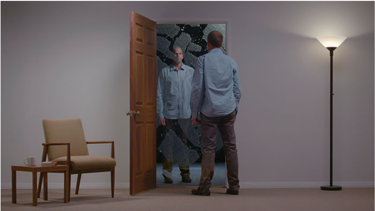
Bill Viola: Angel at the Door (2013). Courtesy the artist and BlainSouthern [/>. Photograph: Kira Perov