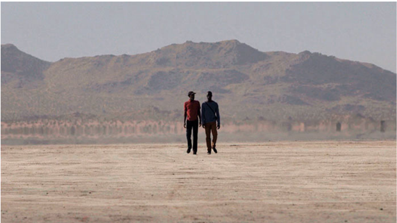
Bill Viola: Walking on the Edge (2012), one of The Mirage series, courtesy the artist and Blain Southern.