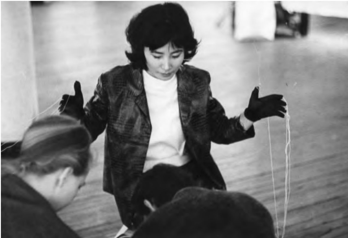
Mieko Shiomi performing 'Direction Event' at the Washington Art Gallery, New York, in 1965.

However, some of the actions were far more easily performable. Allen Ginsberg, in San Francisco, shaking a “small cloud of white salt on the floor”, or John Cage, in North Carolina, dropping answered correspondence into his fireplace.